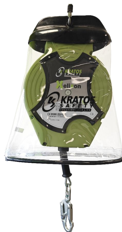
FA 20 906 01 (block sold separately)