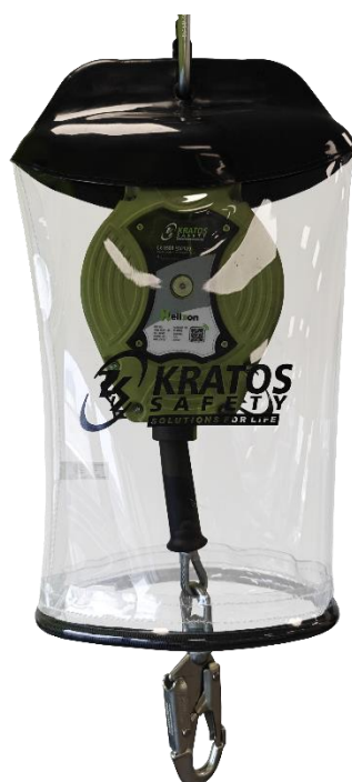
FA 20 906 00 (block sold separately)