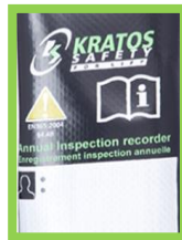
Covered identification labels