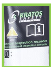
Covered identification label