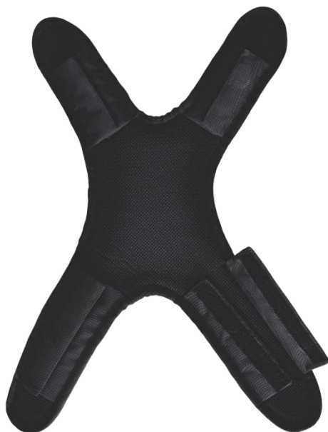
Protection dorsale amovible Removable dorsal pad Protección dorsal extraíble Protezione dorsale amovibile Abnehmbarer Rückenschutz