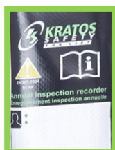
Covered identification labels