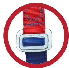
45 mm high strength straps are connecting by metal buckles