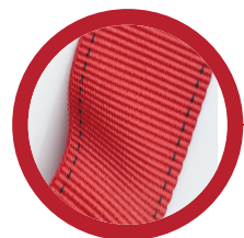
Transverse multidirectional seams