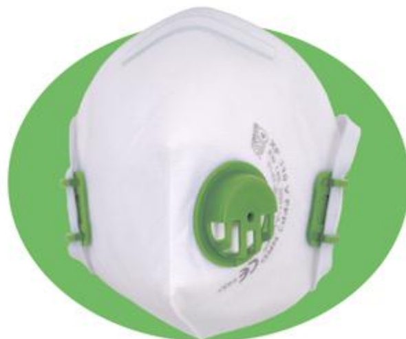
XF 310V FFP3 NR D

The filtering half mask is composed mostly of the face part made of filtering material and accessories such as headbands, or exhalation valve, depending on the model. When air is drawn in, it passes through the filtration material where it is cleansed before being inhaled. Exhaled air passes through filtration material (in the masks without a valve) or through both the exhalation valve and the filtration material (in models with a valve). The cup of the mask should be well adjusted to the user's face.